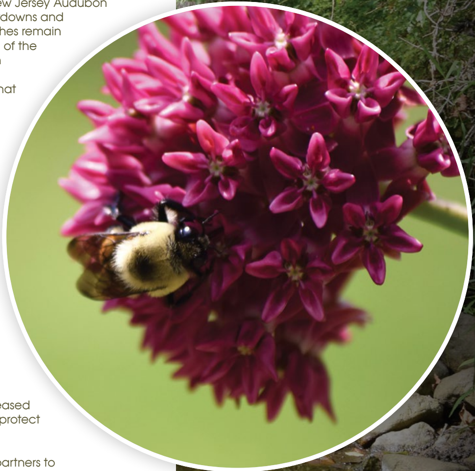
BEE ON PURPLE MILKWEED

At the federal level, we worked with partners to secure the reintroduction of the Recovering America's Wildlife Act. If passed, this law will provide $19 million in new funding every year for wildlife and habitat conservation, research and education. We continued co-leading our four-state coalition, the Coalition for the Delaware River Watershed, and our collective efforts to fund the newly established Delaware River Basin Restoration Program. New Jersey Audubon also worked intensively with a national conservation campaign in efforts to protect the Arctic National Wildlife Refuge for the many birds that migrate to New Jersey each spring which breed in this "ecological jewel" of our nation's refuge system. •