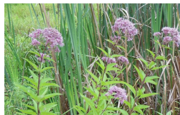
Joe-Pye weed Eutrochium sp. Daisy family