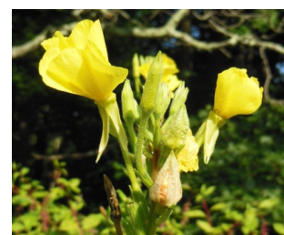
Evening Primrose Oenothera biennis Evening Primrose family