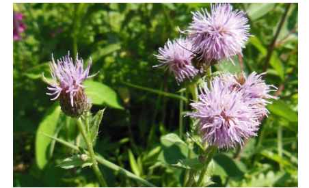
Canada Thistle* Cirsium arvense Daisy family