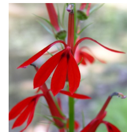
Cardinal Flower Lobelia cardinalis Lobelia family