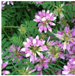
Crownvetch* Securigera varia Legume family