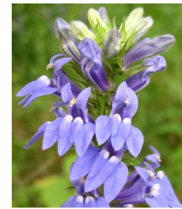
Great Blue Lobelia Lobelia siphilitica Lobelia family