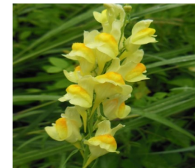
Butter and Eggs* Linaria vulgaris Plantain family