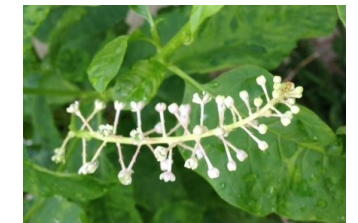
Pokeweed Phytolacca americana Pokeweed family