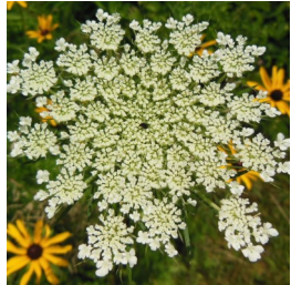
Queen Anne's Lace* Daucus carota Parsley family