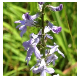
Spiked Lobelia Lobelia spicata Lobelia family