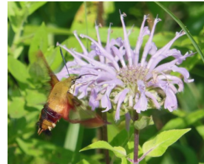
Wild Bergamot Monarda fistulosa Mint family