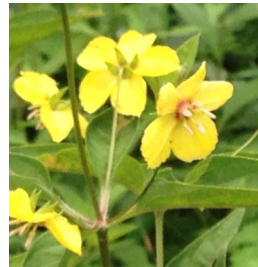
Fringed Loosestrife Lysimachia ciliata Primrose family