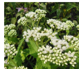
Boneset Eupatorium perfoliatum Daisy family