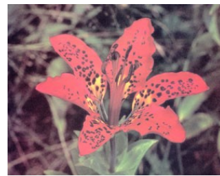
Wood Lily Lilium philadelphicum Lily family