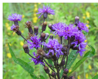
Ironweed Vernonia noveboracensis Daisy family