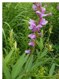
Panicked Tick Trefoil Desmodium paniculatum Legume family