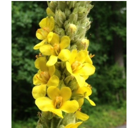
Common Mullein * Verbascum thapsus Figwort family