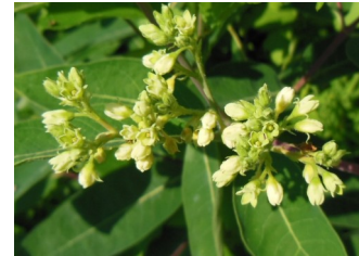
Hemp Dogbane Apocynum cannabinum Dogbane family