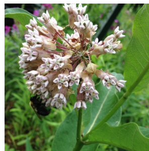
Common Milkweed Asclepias syriaca Milkweed family