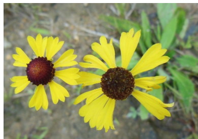
Purple-headed Sneezeweed Helenium flexuosum Daisy family