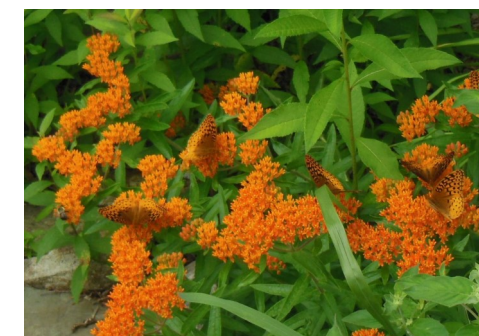
Butterfly Weed Asclepias tuberosa Milkweed family

What's In Bloom? July-Aug.-Sept. At Scherman Hoffman Wildlife Sanctuary 11 Hardscrabble Rd. Bernardsville, NJ 908-396-6386