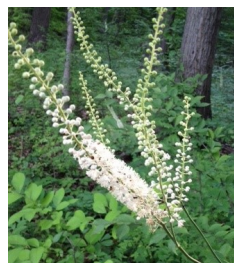
Black Cohosh Actaea racemosa Buttercup family