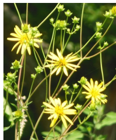
Whorled Rosinweed Silphium asteriscus Daisy family