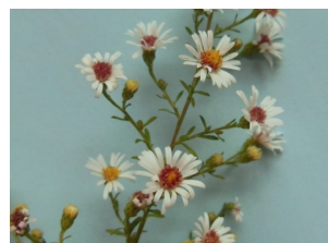
Small White Aster Symphyotrichum lateriflorum Daisy family