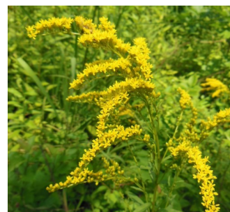
Goldenrod Solidago sp. Daisy family