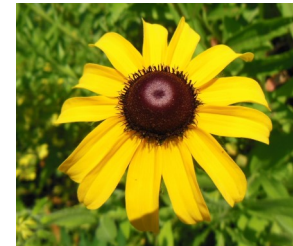
Black-eyed Susan Rudbeckia hirta Daisy family