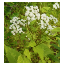
White Snakeroot Ageratina altissima Daisy family