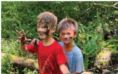
SUMMER CAMPERS