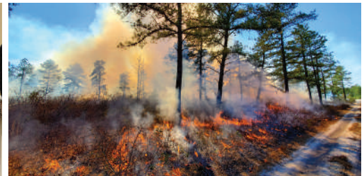
PRESCRIBED BURN