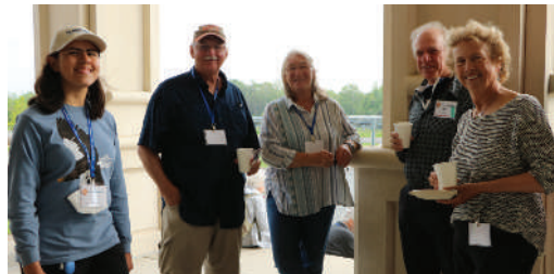
CAPE MAY SPRING FESTIVAL VOLUNTEERS AND FESTIVAL GOERS