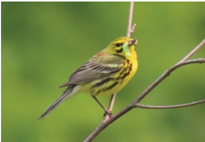
PRAIRIE WARBLER CARRYING FOOD