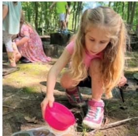
SUMMER CAMPER