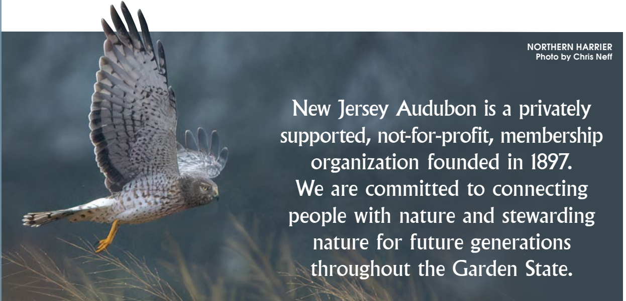
NORTHERN HARRIER

New Jersey Audubon is a privately supported, not-for-profit, membership organization founded in 1897. We are committed to connecting people with nature and stewarding nature for future generations throughout the Garden State.