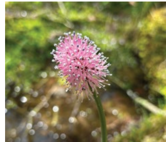
SWAMP PINK