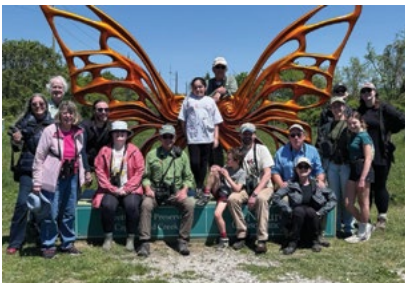
THE SOUTHERN WANDERING TATTLERS WORLD SERIES OF BIRDING TEAM MADE UP OF NEW JERSEY AUDUBON BOARD MEMBERS AND FRIENDS