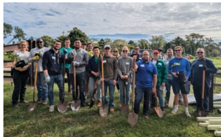
PLANTING EVENT WITH SOUTH JERSEY INDUSTRIES AT CAPE MAY POINT STATE PARK RESTORATION