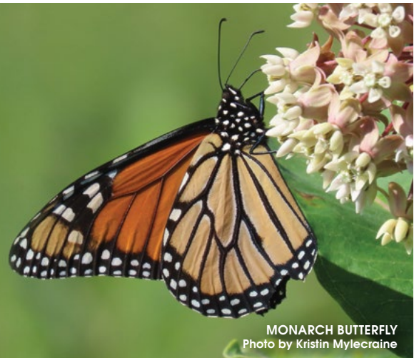
MONARCH BUTTERFLY