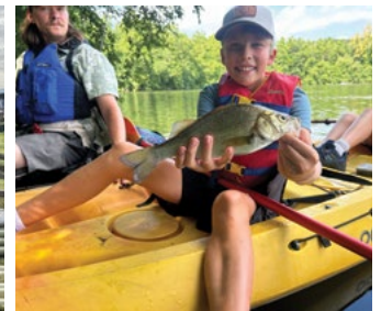
CAMPER WITH A WHITE PERCH WHILE KAYAK FISHING ON POTASH LAKE