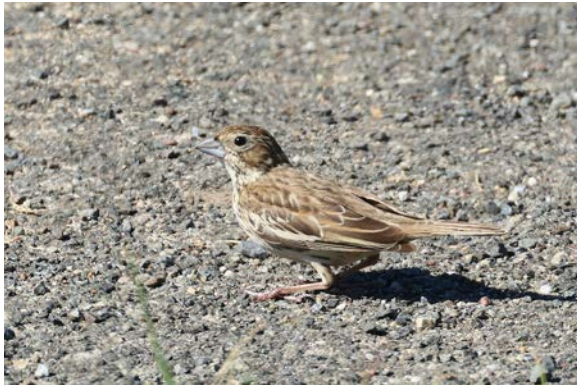
New Jersey's ninth Lark Bunting and the second for Liberty State Park, 6 October 2024.

The female/immature Lark Bunting at Liberty State Park was just the ninth state record and the first in 8 years. Fortunately, it spent most of the day at the Waterfront Walkway and was seen by many lucky observers.