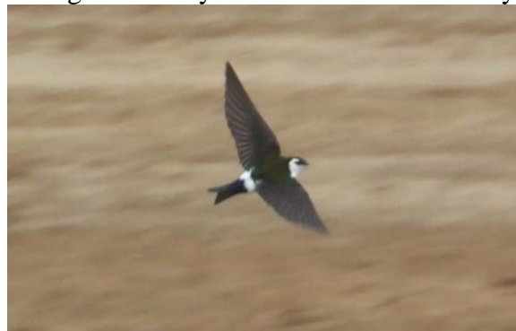
A first for Hunterdon County, this Violet-green Swallow was seen by many birders during its one-day visit to Spruce Run.

Only the seventh record for New Jersey and the first away from the southern coast, this individual was beautifully photographed by the finder and enjoyed by many observers during its one-day visit to Hunterdon County.