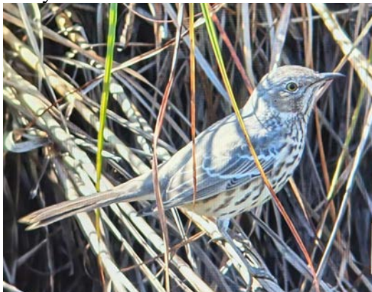
Sage Thrasher at Whitesbog, 12 October 2024, a first for Burlington Co.

Just the sixth record of Sage Thrasher in the state and the first away from the immediate coast, this bird was found in the abandoned cranberry bogs at Whitesbog in the middle of the Pine Barrens. Although it proved to be a one-day wonder, word got out in time for many observers to see it.