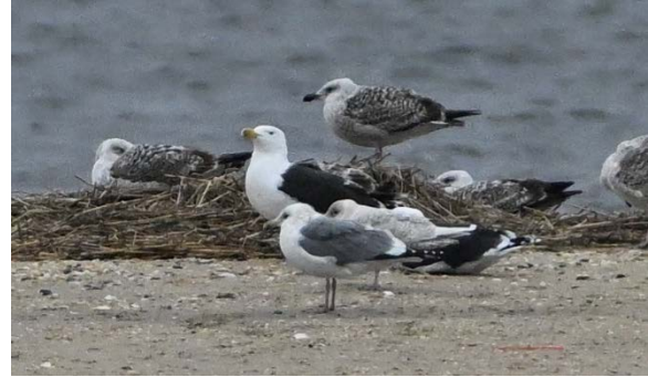
Apparent Vega Gull (foreground) at Sandy Hook, 9 March 2024.