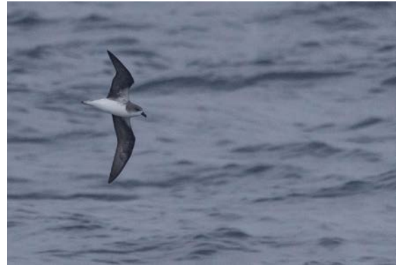
Cape Verde/Desertas Petrel off Ocean County, 3 June 2024.

New Jersey’s first Fea’s Petrels, a species pair rarely recorded in the western Atlantic Ocean away from North Carolina’s Outer Banks, were seen and well-photographed about two hours apart in deep water off Ocean County. Fea’s Petrel has been recently split into Cape Verde Petrel and Desertas Petrel, which nest on different island groups in the Atlantic off Africa. The two species are apparently indistinguishable at sea away from the breeding grounds.