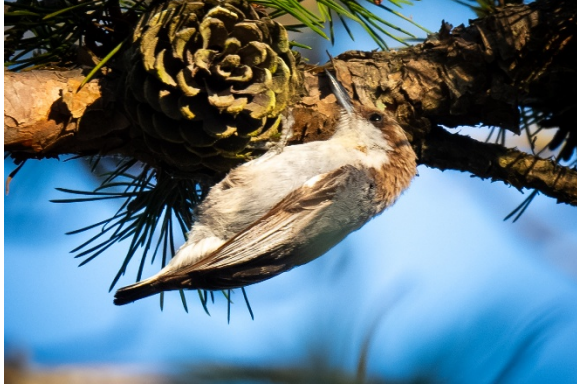
Brown-headed Nuthatch at Lakehurst NAES, 8 June 2024.

from 2018. Most occurrences have been in Spring or early Summer and all except one pelagic record have been from Cape May County. The Lakehurst record was a big surprise and the first for the county and the Pine Barrens.