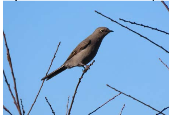
Townsend's Solitaire at Sunrise Mountain, 9 November 2024.

The two records of Townsend's Solitaire came from opposite ends of the state, but both were documented with good photographs. The bird at Sunrise Mountain in Sussex County was the fourth for the site, which also hosted the first state record for a month in late 1980. More surprising was the one that flew by the Coral Avenue dune crossing at Cape May Point, the third record for the county.