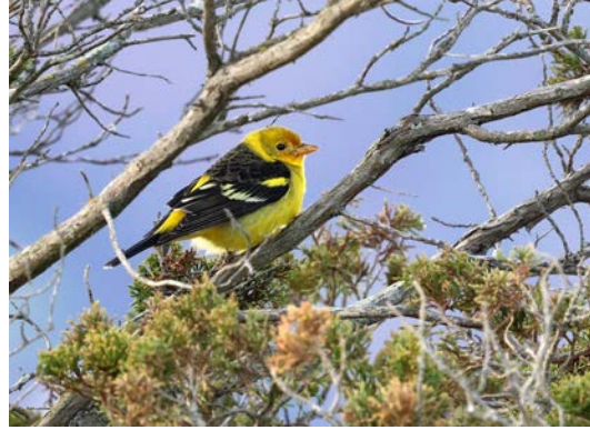
The long-staying male Western Tanager at Sandy Hook.

Reports of Western Tanager have increased markedly in the past decade, with 28 accepted records in ten years. The majority of the occurrences (22 of 28) are from late fall through the winter and the birds often linger at the same location for weeks or even months.