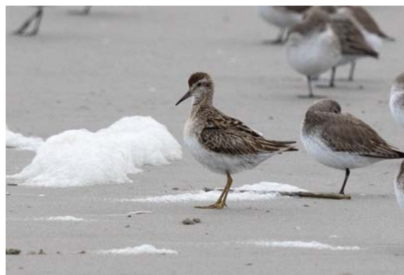
The highlight of the Marmora Christmas Bird Count was this juvenile Sharp-tailed Sandpiper.

An immature Sharp-tailed Sandpiper found during the Marmora Christmas Bird Count is