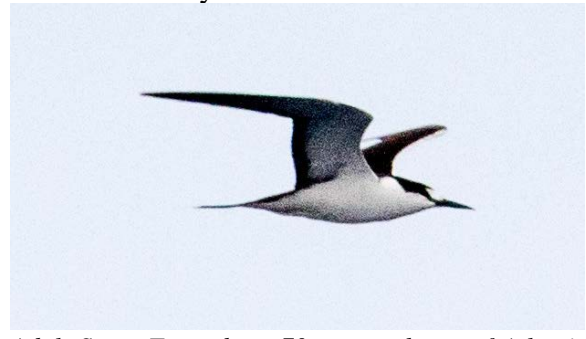
Adult Sooty Tern about 70 nm southeast of Atlantic County.

Always a treat, but usually associated with tropical storms, this adult Sooty Tern was the highlight of the July pelagic trip far off Atlantic County.