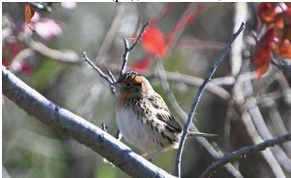
LeConte's Sparrow at Conaskonk Point, 27 October 2024.

LeConte's Sparrow is probably an annual visitor to New Jersey, having been missed in only three of the past 25 years. All but a few records are from late fall or early winter and most are from coastal counties. Because it is so shy and secretive, the species is very elusive and is likely far more common than the number of reports would imply.