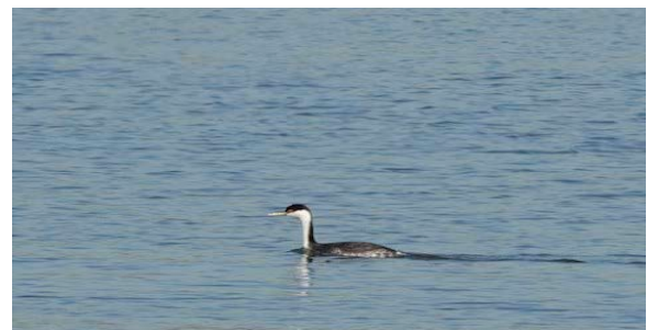
The long-staying Western Grebe at The Amboys, Middlesex Co.

After eight years without any sightings, 2024 saw two records of Western Grebe. The Cape May bird was well described and only seen for a short time. The Middlesex bird was seen by many observers over several months on both the New Jersey and New York sides of the Raritan Bay.