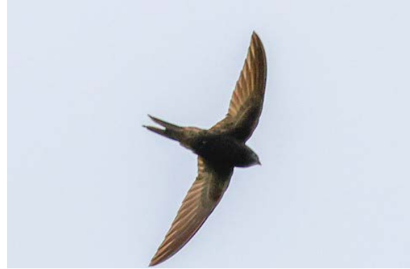
Only the third eBird record for North America, this Common Swift was enjoyed by more than 100 birders during its one-day visit.

A first record for New Jersey, this Common Swift spent a day feeding with Chimney Swifts over the South Cape May Meadows. Good photos and detailed notes allowed the finder to eliminate other Apus Swift species and quickly get the word out, allowing many fortunate birders to share in the sighting. This species breeds across much of Eurasia and winters in Africa, but despite its wide range and migratory nature there are only three vagrant records for North America.