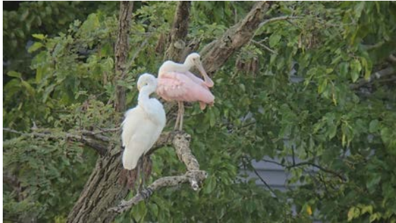
The long-staying Roseate Spoonbill at Henry Hudson Trail.

Yet another Southern species increasingly finding its way north, the three reports of Roseate Spoonbill were well documented by photographs. The Heislerville WMA bird may have been an adult, but the other two were juveniles. Even more were to arrive the following year.